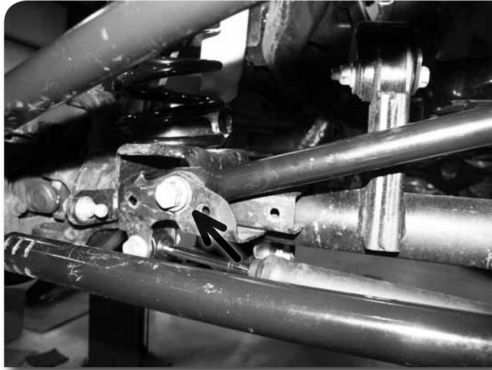
Figure 1 - LHD (Left Hand Drive) Shown