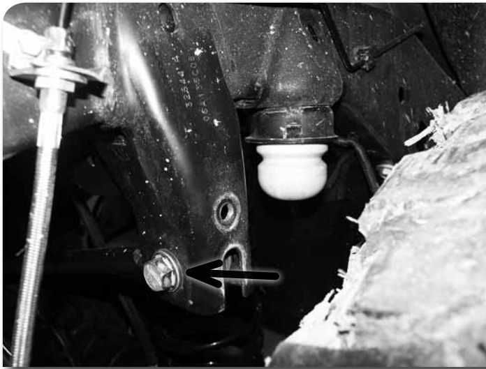
Figure 3 - LHD Shown